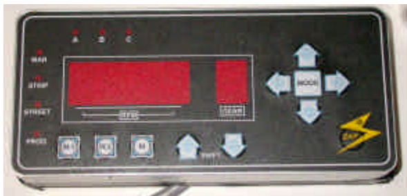
Programmable Shift Control Pad