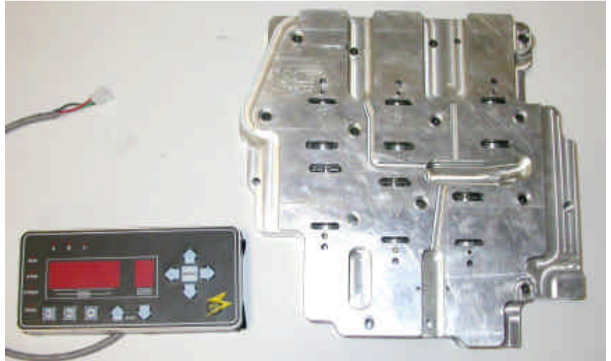
700-R4 Billet Control Body & Controller

Upgrade your older transmission with electronic control for unparalleled performance at the strip or on the street.