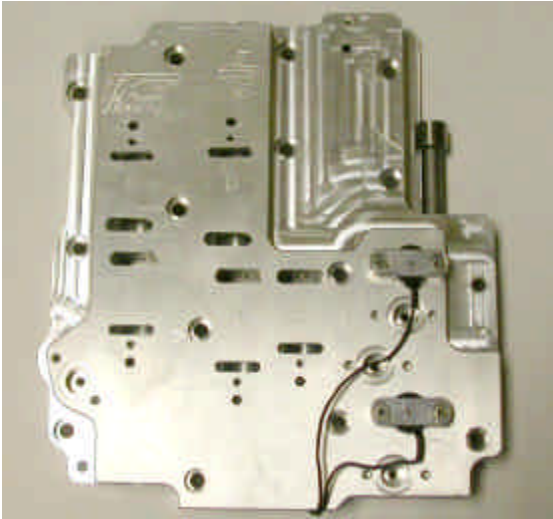
200 4R Billet Control Body